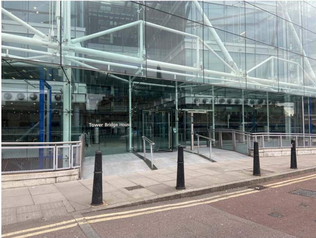
Street Level Entrance to the Building with step free access.

RPC is located on Levels 1, 3 and 4 of Tower Bridge House and our main reception is located on Level 1 (street level). Tower Bridge House can be accessed through our main entrance along St Katherine's Way where there is step free access. The building can also be accessed dockside via a lift and escalators which will bring you up to main reception. This entrance is open from 0700 until 1900.