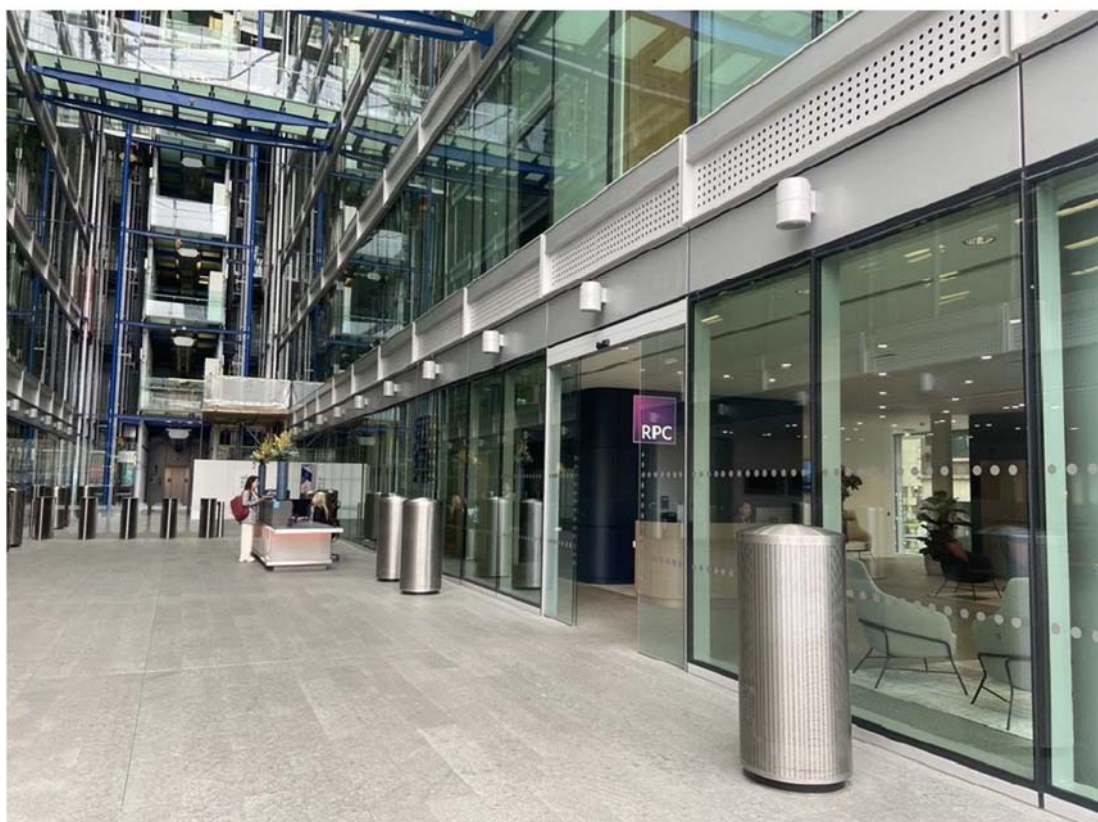
Street Level Entrance to the Building. RPC Reception located on the right. Access to our Ground 1 meeting rooms available through RPC reception.