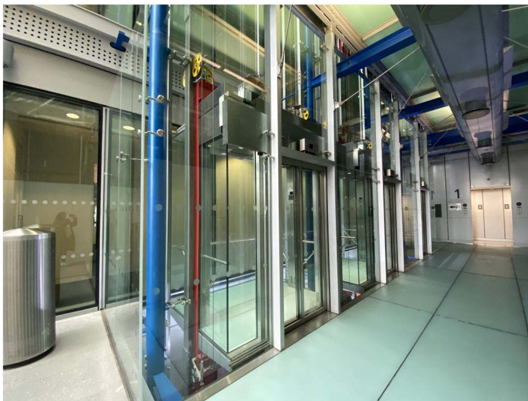
Lifts up to our working floors (3 & 4).