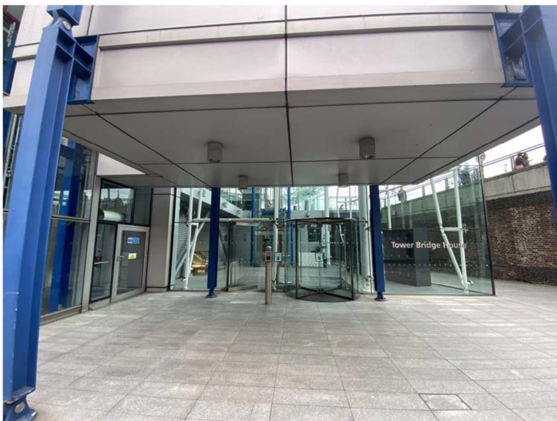
Dockside Level Reception & lift up to main reception.